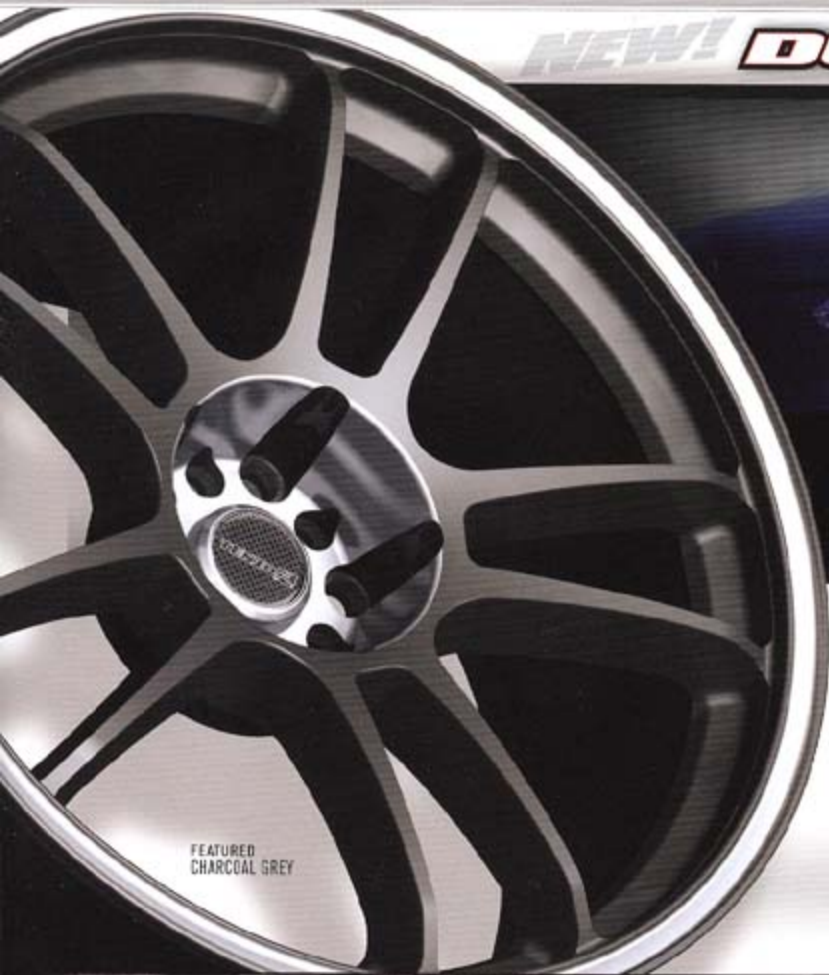
FEATURED CHARCOAL GREY